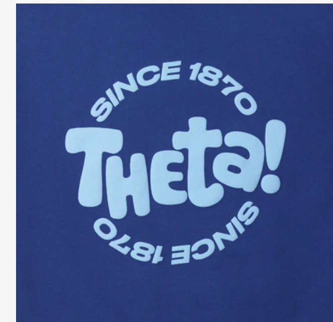
PUFF PRINT ORDERS 50+