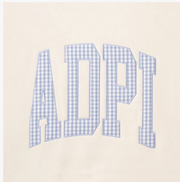
TWILL PATCH ORDERS 25+