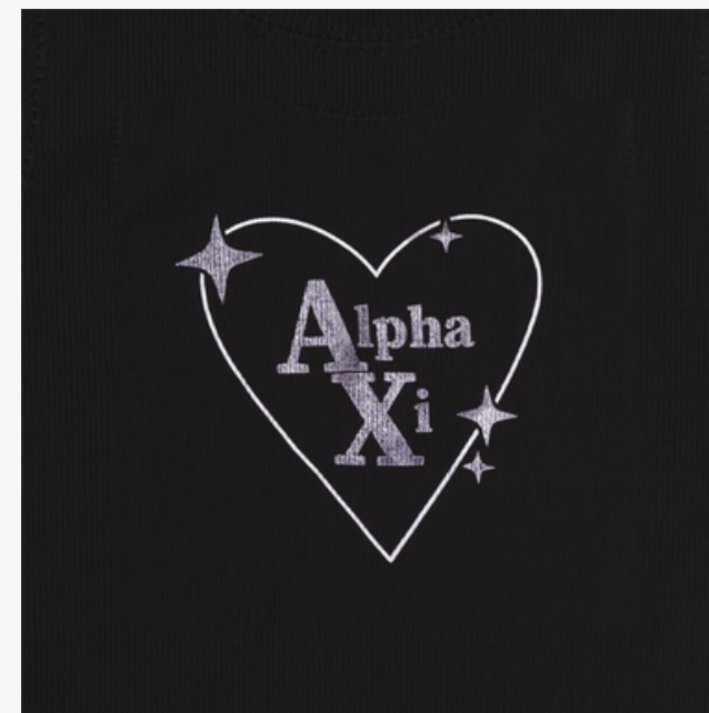
GLITTER PRINT ORDERS 50+