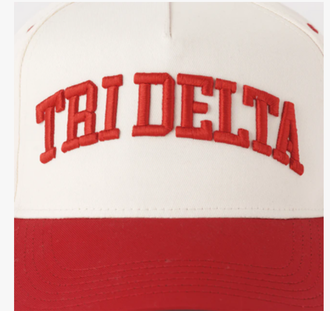
PUFF EMBROIDERY ORDERS 25+