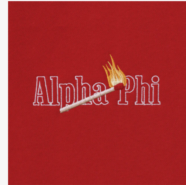
EMBROIDERY ORDERS 25+