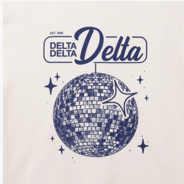
SCREEN-PRINTED ORDERS 25+